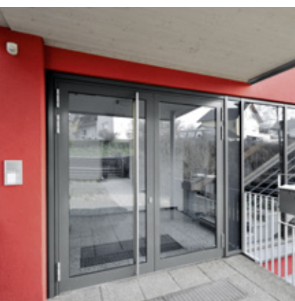
旭格铝合金 门系统ADS 70 HD Schüco Aluminium door system ADS 70 HD