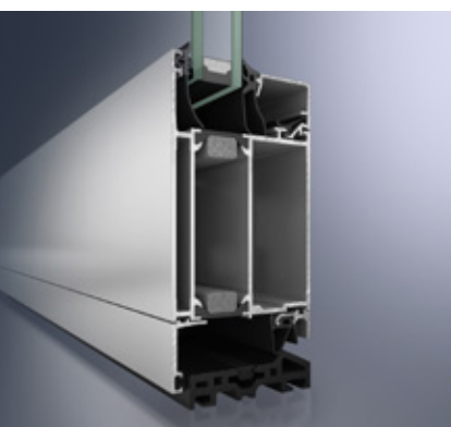
旭格ADS 70 HD门系统 Schüco door ADS 70 HD