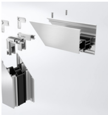
可选用螺丝加工角插件 Screw-type corner cleats are an option