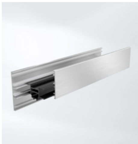
分开的隔热条减少双金属效应 Split insulating bar to reduce the bi-metallic effect