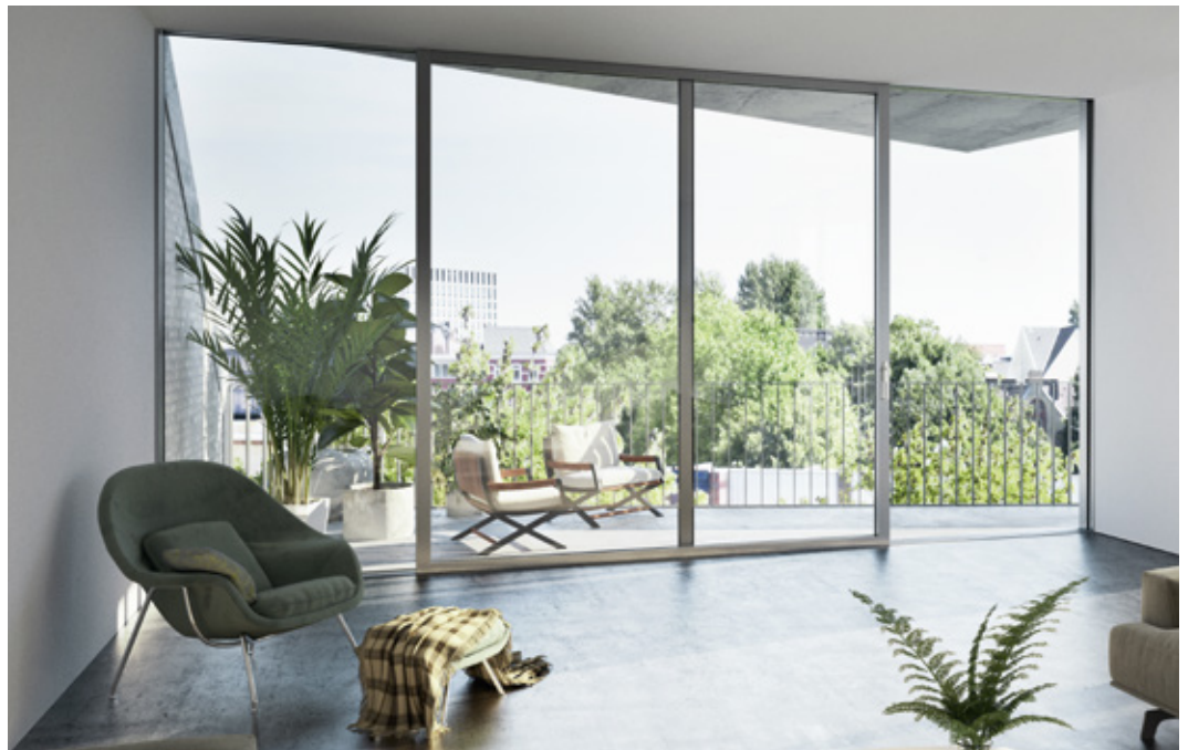
大规模推拉扇提供广阔的创意自由空间 Large vents provide plenty of creative freedom

The Schüco ASE 60/80 sliding system range sets new standards