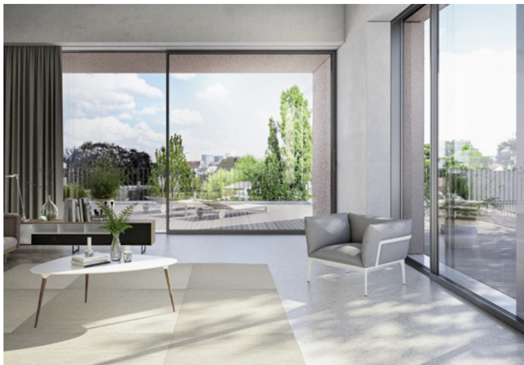
隔热可达被动房水准 Thermal insulation to passive house standard

Integrated SmartStop and SmartClose modules ensure more than just security during operation and increased user comfort. In the lift-and-slide versions, two further modules assist the user in lifting and lowering the moving vent. During lifting, an integrated operating aid helps the user by means of spring tension, making the vent even easier to open. During closing and lowering, another module, a handle damper, cushions the vents and operating handle. These two modules make even large-scale formats easy to operate.